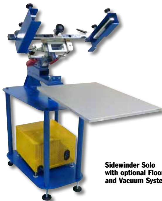
Sidewinder Solo with optional Floor Stand and Vacuum System