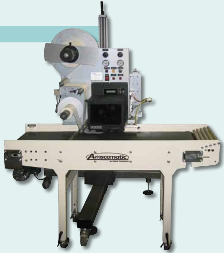
Shown with optional horizontal conveyor

Compared to manual labeling operations, the integrated UPA-II Print/Apply System provides dramatic improvements in quality,