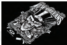
Screen Printed Underbase