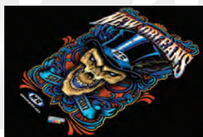
Digital Printed Colors