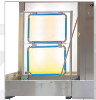
Unload Clean Screens