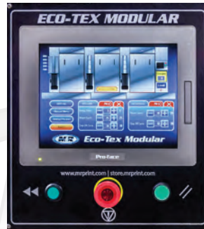
Enter Cleaning Recipe