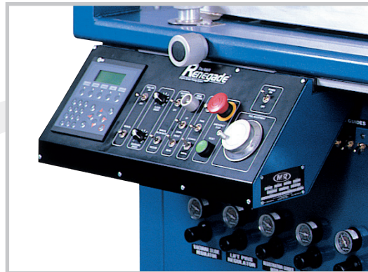
Movable control panel is easy to navigate, with programming and prompts in plain language

Renegade has up-front control of SoftVac,™ M&R's whisper-quiet, high-volume vacuum system. Vacuum and blowback are each independent and adjustable. Options include M&R's dripless squeegee attachment, which automatically flips to the opposite direction against the front of the floodbar, and Renegade's stepper-motor peel system, which provides flat flood capability and single-point fingertip control.