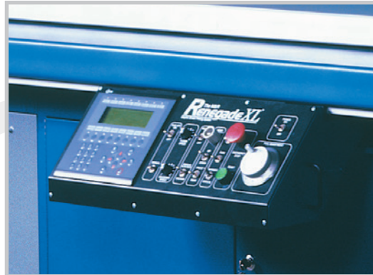
Movable control panel is easy to navigate, with programming and prompts in plain language

Renegade XL has up-front control of SoftVac,™ M&R's whisper-quiet, high-volume vacuum system. Vacuum and blowback are each independent and adjustable. Options include M&R's dripless squeegee attachment, which automatically flips to the opposite direction against the front of the floodbar, and a stepper-motor peel system, which provides flat flood capability and single-point fingertip control.