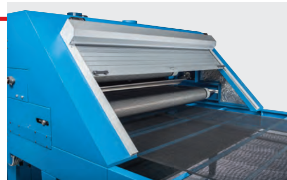
INTEGRATED ROLL-DOWN OUTFEED HOOD

3 Normal usage varies, but is significantly lower than the stated maximum