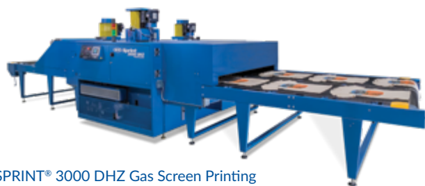
SPRINT® 3000 DHZ Gas Screen Printing Conveyor Dryer with Dual Heat Zones

Get an early start to summer and set your business free with M&R's Freedom Equipment Finance Special!