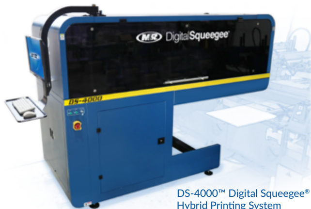
DS-4000™ Digital Squeegee® Hybrid Printing System